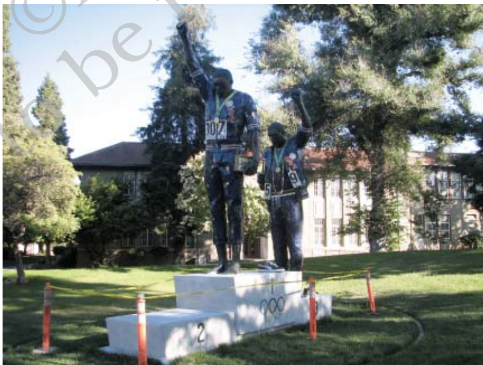
In 2005, the San Jose State University installed a 20-foot high sculpture representing the protest by Tommie Smith and John Carlos. A photograph of the original medal ceremony in 1968 is on the top.

Do you think that Carlos and Smith should have raised an internal matter of American society in an international forum? Would you say that what they did was political? Why do you think Peter Norman, who was neither Black nor American, joined in the gesture of protest? If you were in Norman's place what would you do?